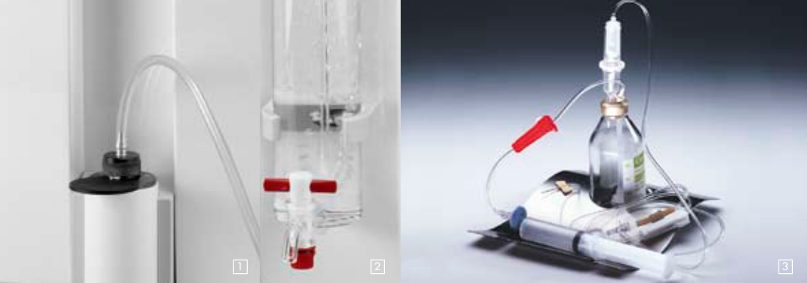
OZONOSAN: EFFICIENCY AND KNOW HOW IN OZONE THERAPY

At the very least, complementary oncology in a holistic medical context produces a considerable improvement in the general condition of the patients involved, reduces the side-effects of chemotherapy and radiation and thus contributes to life quality in a very real sense.