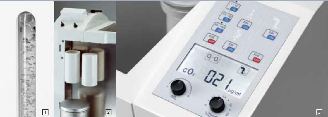
GUARANTEES AN OPTIMUM IN SAFETY AND EFFICACY

Angiopathias, particularly diabetic angiopathia, arterial circulatory disturbances and diabetic foot are classical indications for ozone/oxygen therapy.